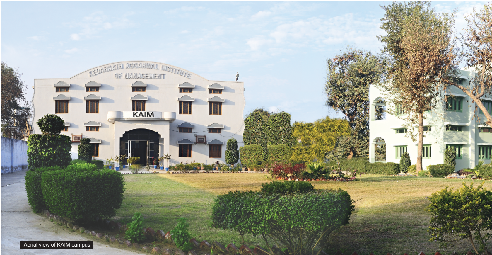
Aerial view of KAIM campus